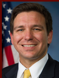
Governor Ron DeSantis