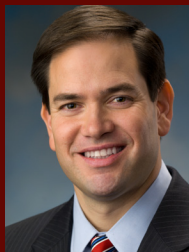
US Senator Marco Rubio

Confirmed(*) and Invited Special Guests include: