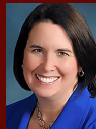
Senator Kelli Stargel*